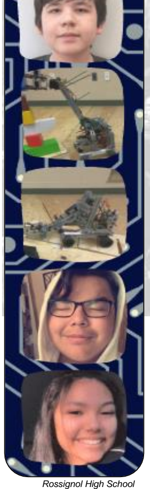
Robotic Huskie Squad

All emergency funds received are used to provide: immediate access to technological solutions for distance learning, laptops and internet service to students. access to mental health and wellness resources, and direct supports to help meet basic needs like rent, childcare, and medications.